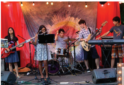
RiverArts Jazz Ensemble